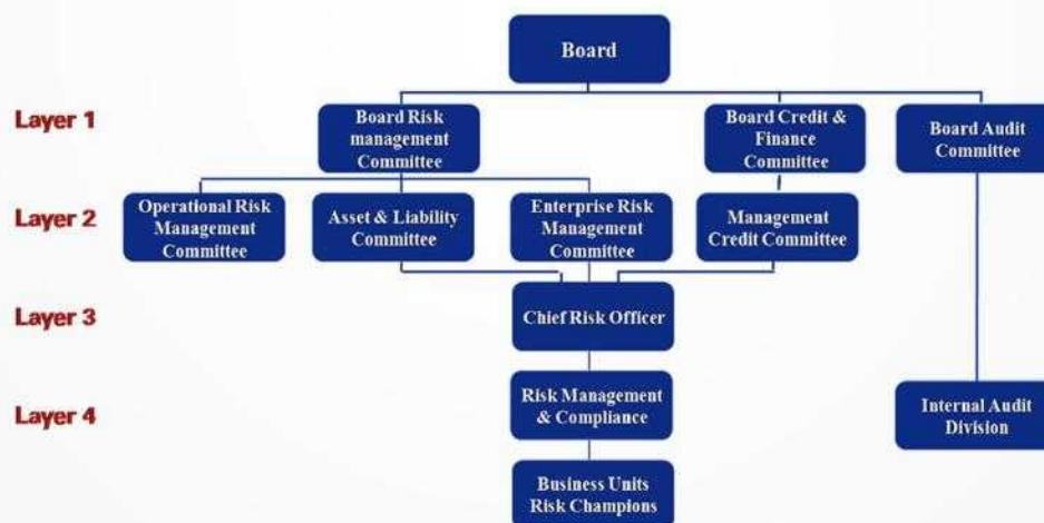
Fig 6:: Access Bank's Plc. Risk Management Governance Structure

Access Bank's Risk Management Governance Structure is depicted below.