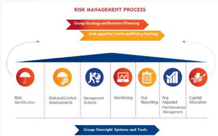
Fig 7: Access Bank's Plc. Risk Management Process

In this regard, the Bank's risk management philosophy is that a moderate and guarded risk attitude ensures sustainable growth in shareholder value and reputation.