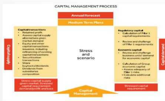
Fig 10: Access Bank's Plc. Capital Management Process

The above diagram illustrates the process the Bank follows to ensure end-to-end integration of the Bank's strategy, risk management and financial processes into the capital management process. The purpose is to ensure that capital consumption in the business divisions has an impact on performance measurement, which in turn translates into management performance assessment and product pricing requirements and achievement of the overall strategy within risk appetite.