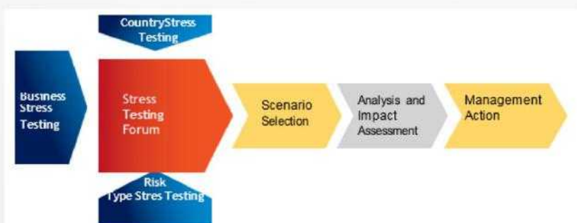
Fig 8: Access Bank's Plc. Stress Testing Framework

The Group strives to improve all in-house analytical reporting of risk management in the Bank and stimulate a culture of data-driven analytical insights for every decision impacting all risk touch points in the risk management process. The quality of risk reporting has been greatly enhanced as a result of the implementation of an automated risk reporting system known as the Risk Management Report Portal and the subsequent inclusion of the Subsidiary Risk Management portal. This has led to easy and timely access to risk reports, provided early warning signals, better limit monitoring and better decision making for all units across risk management.