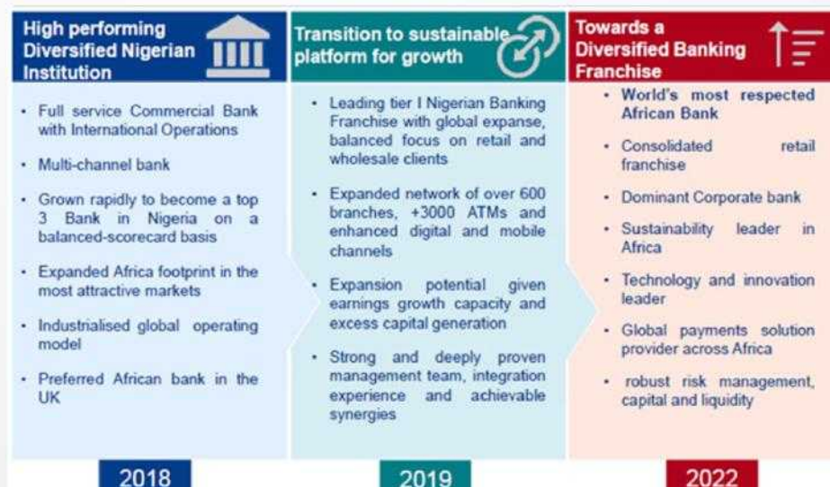
Fig. 1: 2019- A pivotal point in our Transformational Journey